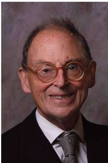
The Rt. Hon. Lord Justice Thorpe Head of International Family Justice for England and Wales Lord Justice of Appeal Liaison Judge for England and Wales Royal Courts of Justice

Hague Convention cases. Where judgment should be issued within 6 weeks 3 it takes on average 165 days between Brussels II bis States and 215 days where neither State was a Brussels II bis State. Only 28% of Brussels II bis applications to England and Wales were resolved in 6 weeks (37 out of 130) 4 .